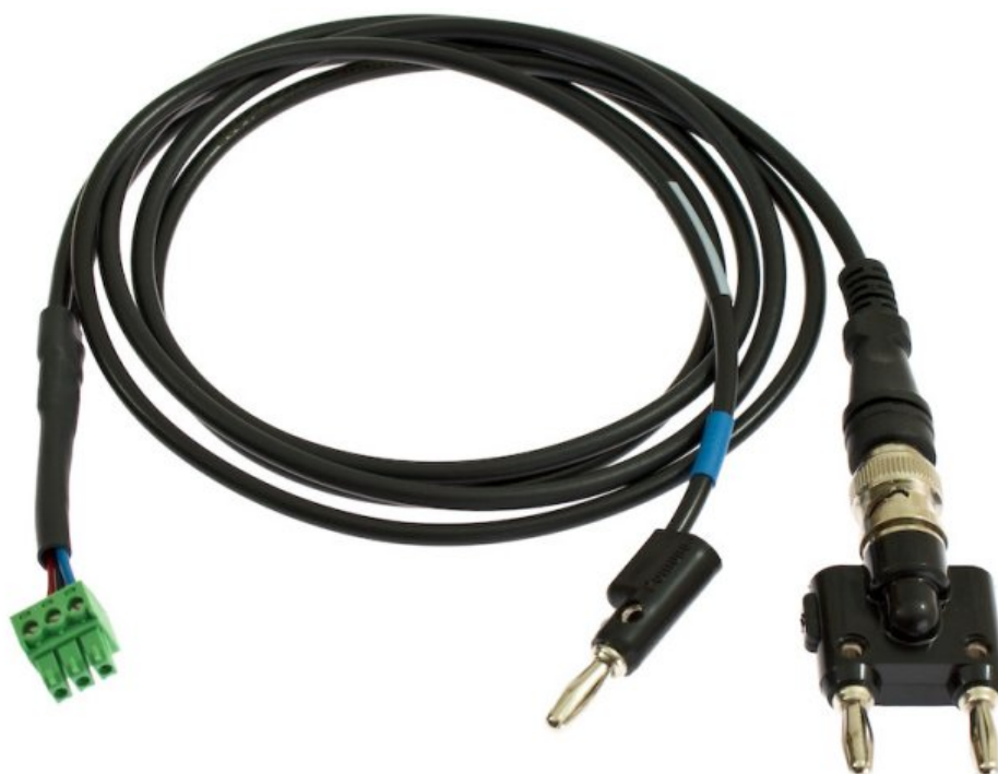
Figure 2. The Rotation Rate Control Cable (AKCABLE4) for Connecting a Pine Potentiostat to an MSR Rotator.