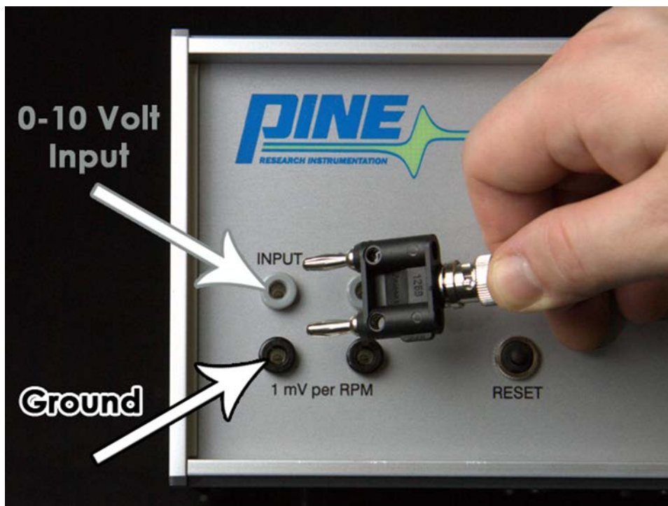
Figure 3. Connection of the Rotation Rate Control Cable to the MSR Control Unit.

One of the lines of the rotation rate control cable terminates in a BNC-to-Dual-Banana connector. This line carries an analog signal and a ground from the potentiostat to the control unit. Connect the dual banana jack into the "INPUT" signal port on the front of the control unit (see: Figure 3). Notice that the ground of the dual banana jack has a small black tab labeled with the letters "GND" on it. Make certain the jacks are installed with the correct orientation into the banana ports.