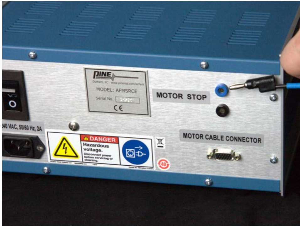
Figure 4. Rear Panel of the MSR Control Unit Showing Motor Stop Connection.