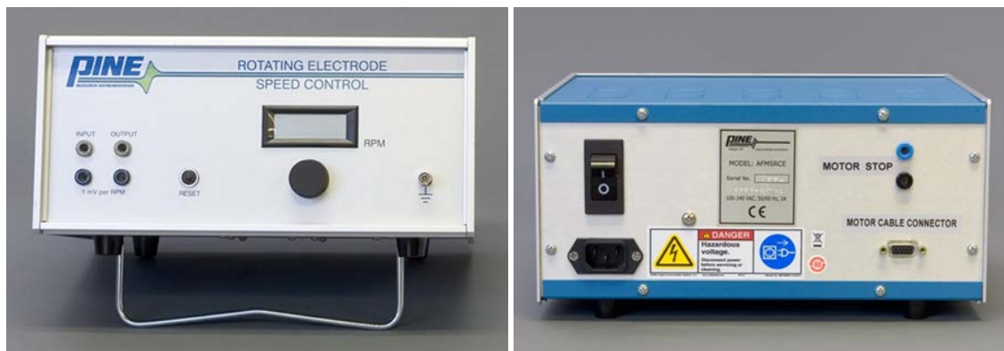
Figure 1. Front and Rear Views of the Pine MSR Control Unit

Alternatively for software control of the rotation rate, an external analog voltage can be supplied to the control unit INPUT using the banana plugs on its front panel (see: Figure 1). Compatible WaveDriver and WaveNow potentiostats are configured to supply an analog voltage for controlling a rotator. Other potentiostats may support this feature; contact your potentiostat vendor to check compatibility and for any special cables or software requirements. Compatible Pine potentiostats under AfterMath control can be connected directly to the MSR Control Unit using a rotation rate control cable (AKCABLE4) (see: Figure 2). NOTE: Not all Pine potentiostats have an analog output feature (see: "Compatible Pine Potentiostats" section).