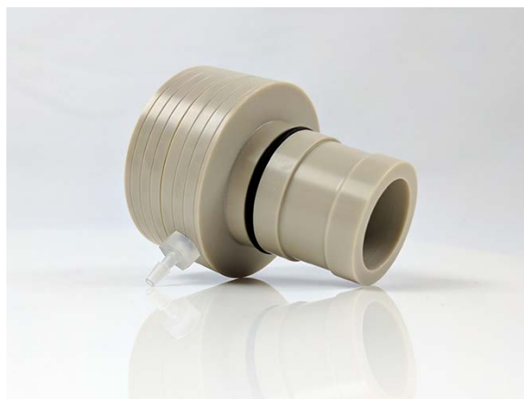
Figure 2. Gas-Purged Bearing Assembly

PEEK is not compatible with concentrated acids. Prolonged exposure to concentrated acid will cause discoloration.