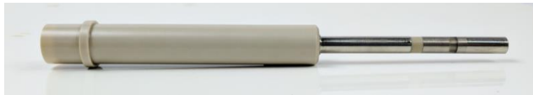
Figure 2. Precision 15 mm RDE/RRDE Shaft for MSR Rotators

The Gas-Purged Bearing Assembly is compatible with precision-machined 15 mm OD shafts. Pine Research Instrumentation manufactures three such shafts: the RDE/RRDE Shaft for MSR Rotators (part #: AFE6MB), the Single RCE Shaft for MSR Rotators (part #: AFE9MBA), and the Double RCE Shaft for MSR Rotators (part #: AFE9MBDA). The RDE/RRDE shaft is used for rotating disk electrode (RDE) and rotating ring-disk electrode (RRDE) experiments and accommodates a variety of electrode tips (see: Figure 2). The Single and Double RCE shafts are used for rotating cylinder experiments (RCE) and accept 15 mm OD cylinder inserts (see: Figure 3). All three shafts have a stainless steel rod for connection to the electrode tip/insert and a retaining ring to keep the bearing assembly in place.