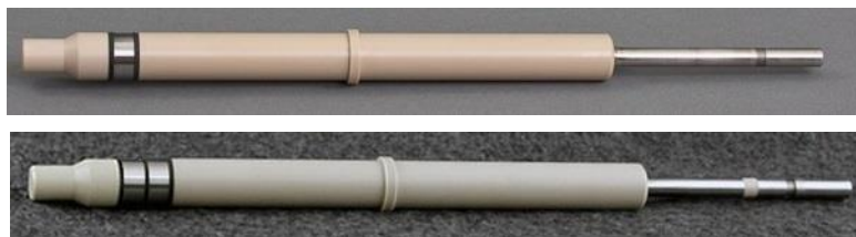
Figure 3. Precision 15 mm Single and Double RCE Shafts for MSR Rotators