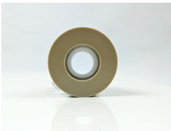
Figure 1. Gas-Purged Bearing Assembly