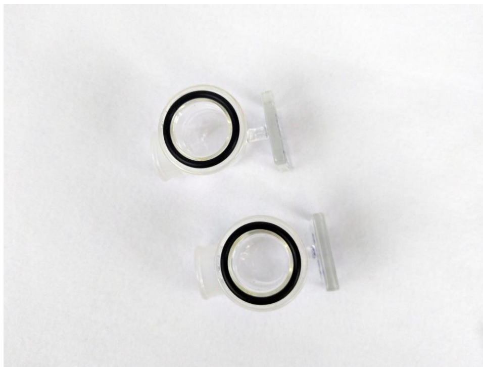
Figure 1-1. Lay each cell half down and place an O-ring in the groove of the spherical joint.

The membrane cell is designed to create a two compartment electrochemical cell, where the researcher provides their own separator. Often, a porous glass frit is used to allow electrical connection between cell halves but a diffusional barrier for mass transport (e.g. to prevent mixing of species from anode and cathode side of the cell).