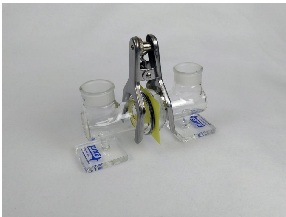
Figure 1-3. Fully open the spherical joint clamp and use the prongs to grip each side. Tighten the set screw if necessary,