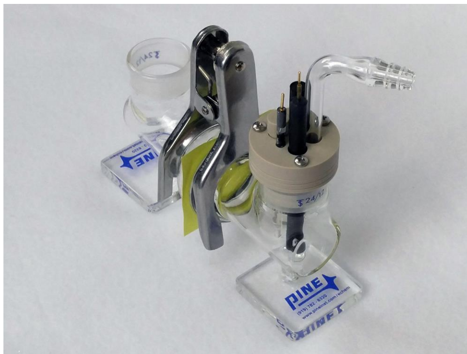
Figure 1-10. Ensure the cap seals around the probes and then install the entire cap into the cell port. Do the same for the other side. The researchers chooses which electrodes and probes to put on each side. In general, one side typically has a working and reference electrode while the other side has a counter.