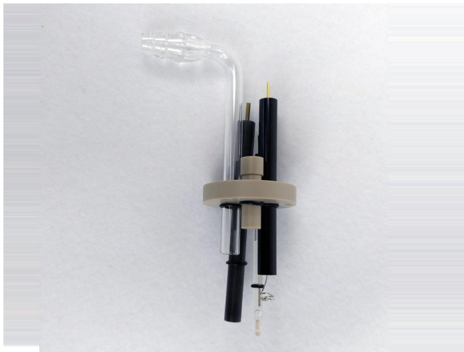
Figure 1-5. Repeat the probe and O-ring insertion for each type of electrode, plug, or glass tube. Take special caution to appropriately adjust the height of the O-ring to ensure the assembled cap will fit into the cell without the probes hitting the bottom of the cell surface.