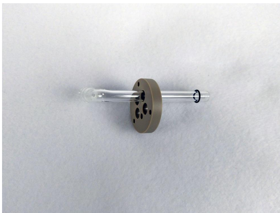
Figure 1-4. With the thin aspect of the cap kit, insert a probe (a vent tube in this image) through the appropriate hole and add an O-ring.

The basic principle of the cap kit is to seal all probes (i.e. electrodes) into the cap by wedging a soft O-ring between the upper and lower halves of the cap and clamping the halves together to seal any gaps. Then, the assembled cap kit seals directly into the cells. The following images will walk through the steps to position and seal the electrodes in the cap, then the cap in the cell.