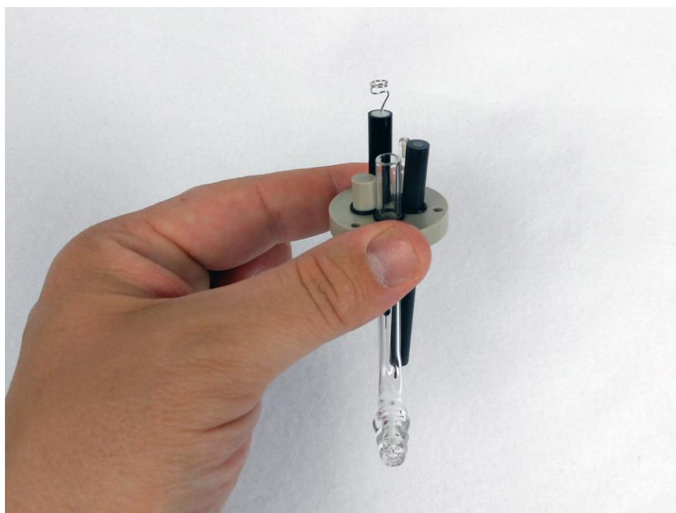
Figure 1-6. Invert the cap so that the probes are held in place when the O-ring hits the cap. Again, adjust height appropriately.