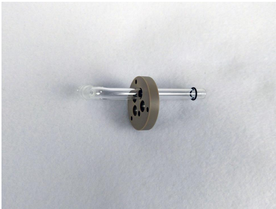
Figure 1-1. With the thin aspect of the cap kit, insert a probe (a purge tube in this image) through the appropriate hole and add an O-ring.

The basic principle of the cap kit is to seal all probes ( i.e. , electrodes) into the cap by wedging a soft O-ring between the upper and lower halves of the cap and clamping the halves together to seal any gaps. Then, the assembled cap kit seals directly into the half cells. The following images will walk through the steps to position and seal the electrodes in the cap.