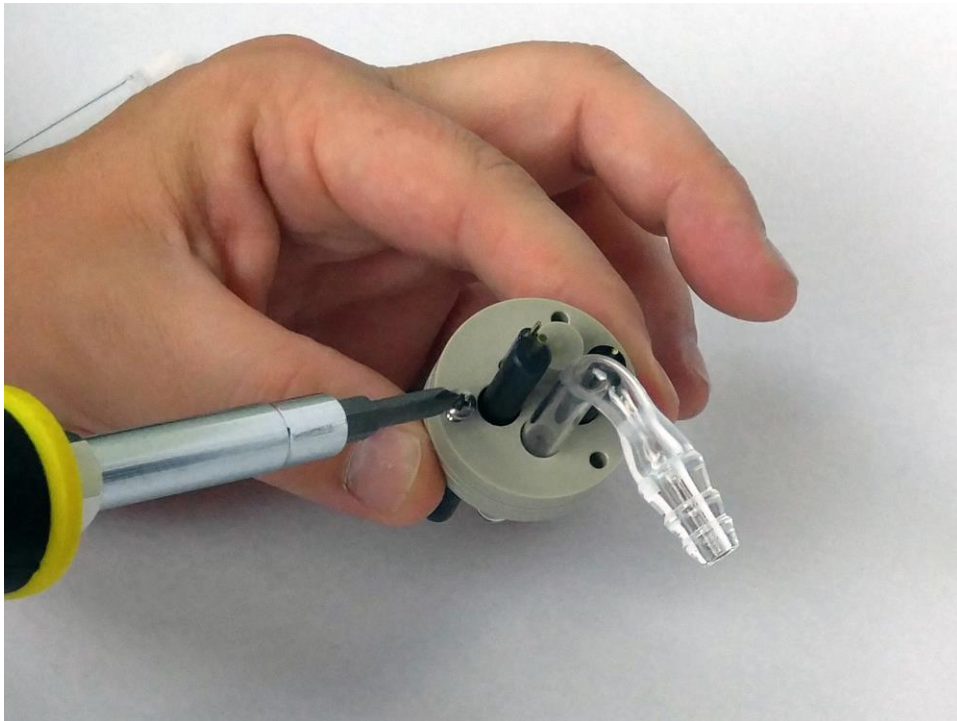
Figure 1-5. Install a screw to join the two cap halves. Loosely tighten one screw at a time to appropriately balance the cap seal. Note: DO NOT YET TIGHTEN SCREWS. It is useful to insert the cap kit with electrodes into the cell at this stage, before completely tightening the three screws. This allows any displaced air in the cell from becoming pressurized as the cap kit is pressed into place.