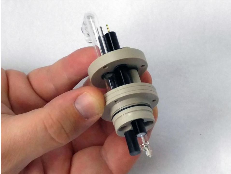
Figure 1-4. Slide the larger part of the cap kit onto the probes. Note: there is a directionality and the cap will only fit on in one orientation. Shown here is the cap kit with probes and O-rings installed, just before sealing the probes into the cap.