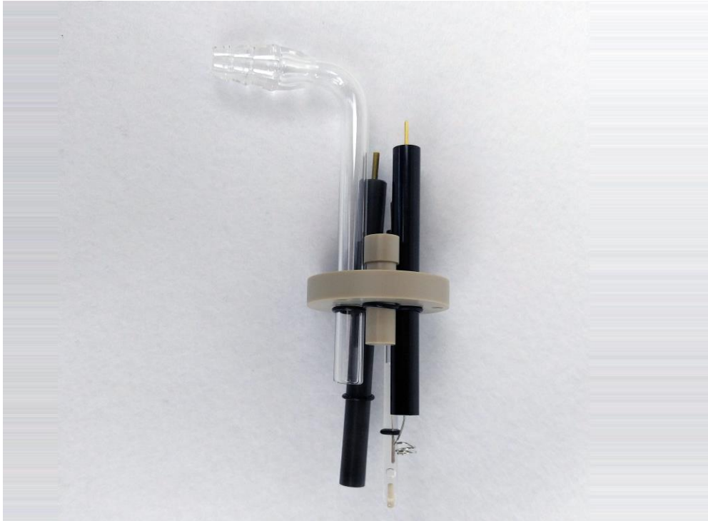
Figure 1-2. Repeat the probe and O-ring insertion for each type of electrode, plug, or glass tube. Take special caution to appropriately adjust the height of the O-ring to ensure the assembled cap will fit into the cell without the probes hitting the bottom of the cell surface.